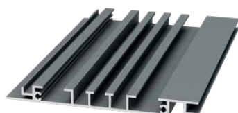
120MM FLOW CLADDING BOARD