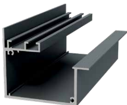
WIDE FLOW CLADDING GUTTER

Flow cladding and soffit gutters can be used with all of our decking and joist solutions!