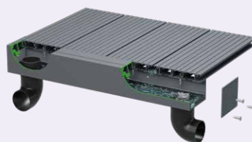
DECK LEVEL PIPED