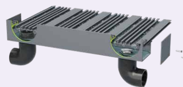
SOFFIT LEVEL PIPED