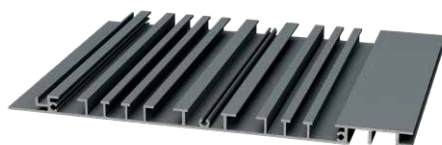
240MM FLOW CLADDING BOARD