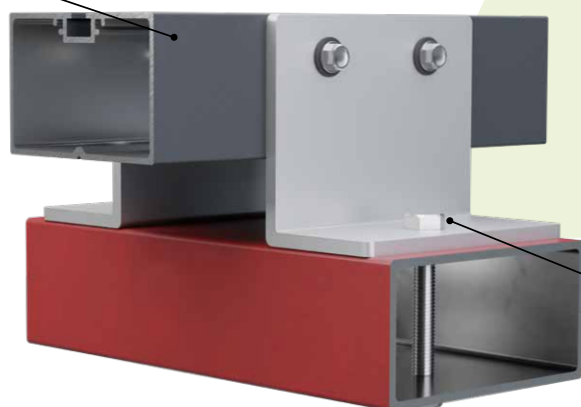
ECO 50 JOIST

Standard Pedestal Brackets Adjustable Pedestal Brackets Jumbo Adjustable Pedestals Wind-up Pedestals Low Connection